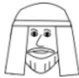
James (brother of John)