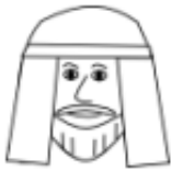
James (son of Alphaeus)