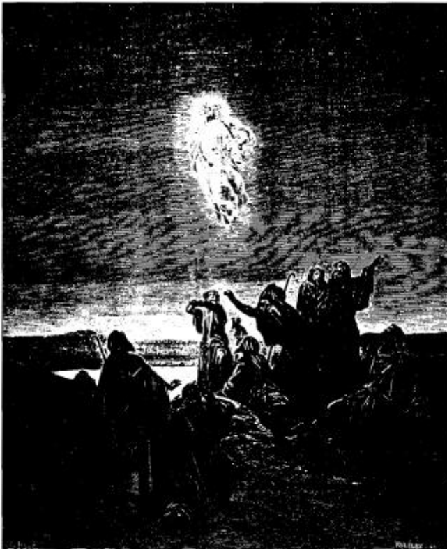
Jesus Ascending. "If I go away, I will come again..."

The whole present social structure of the nation is being shaken to the ground and is being transformed. Equality of rights for all the individuals is acknowledged almost everywhere and the increasing knowledge, which is in a way the growing light of the first beams of the Sun of Justice, has considerably changed the physiognomy of the world. Although the knowledge has often been used for selfish purposes, nevertheless it has brought many blessings to the world. The Lord has already made great changes in the world.