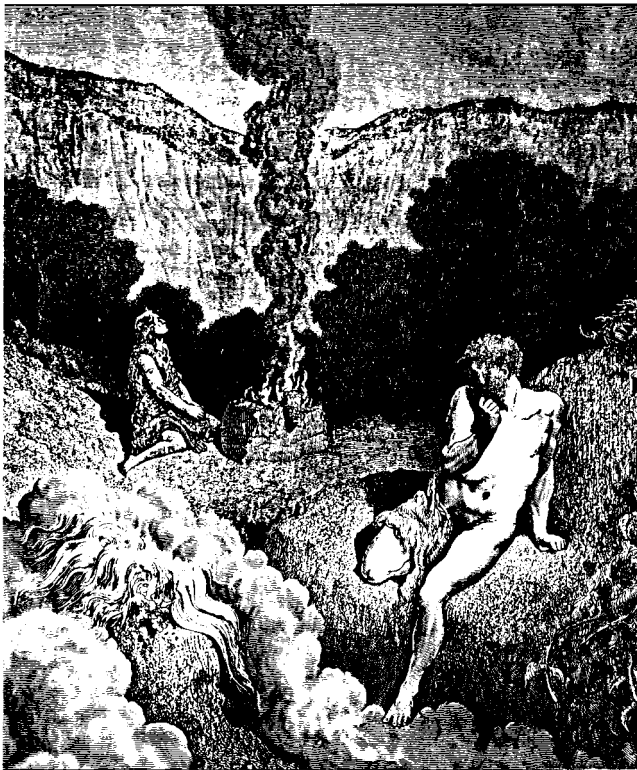
Cain and Abel offering their sacrifices.

Hopes must have run high, therefore, as the lad grew to manhood's estate, joined later on by his younger brother Abel, and, of course, sisters. With the elder devoting his energies to cultivation of the soil and the younger to the raising of sheep and goats the family must have been reasonably happy, waiting for the next move in the Divine purpose, and with no indication of the tragedy soon to come.