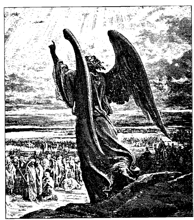
The Angel Appearing to Joshua

The Hebrew word for "shout" is terumah , which means "acclamation of joy, or a battle cry" (Strong's #8643). During this seventh day, both spiritual and fleshly Israel are going through their own wars, in parallel, and both Israels are nearing the final phase which will sound the "great shout."