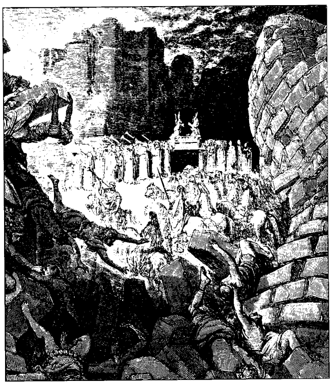
The Walls of Jericho Falling Down

of these experiences will be a time of a "shout" of victory. However, prophecy marks out subsequent trials for both Israels. Spiritual Israel will be taken to glory in a fiery chariot