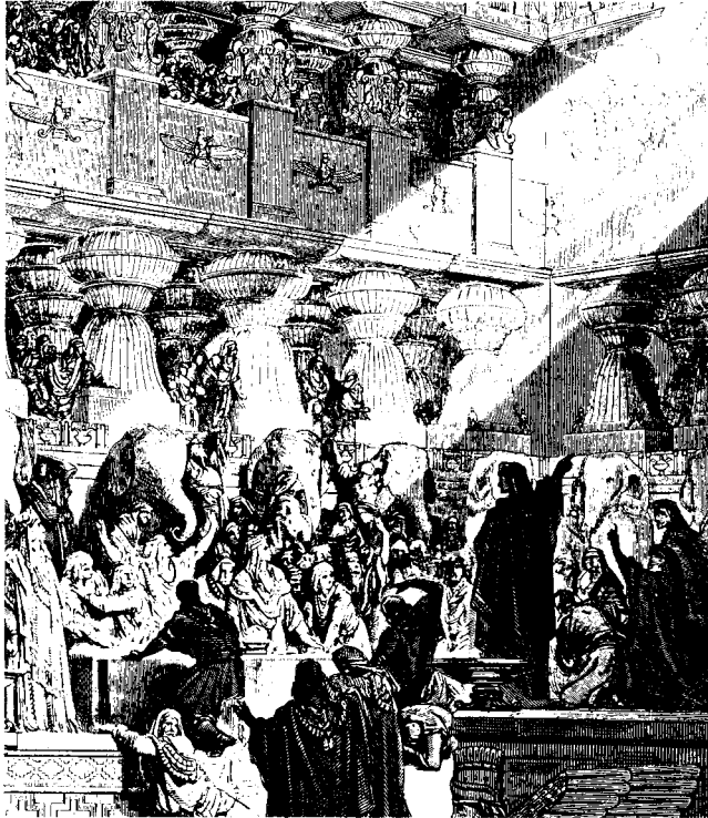
Daniel Interpreting the Writing on the Wall

confirmation that this is a fixed period of 2,520 years 2 by multiplying 7 by 360 Jewish calendar days rather than 354 lunar days or 365 solar days. 3 In other words, “Searching what, or what manner of time the Spirit of Christ which was in them did signify.” (I Peter 1:11) We hold that these seven times are based on the same 360 day formula that is required in Revelation 11 and 12, where 3½ times (years), 42 months and 1260 days all express the length of one span. Further, we hold that each day is fulfilled by a natural year, as in Revelation 11 and 12.