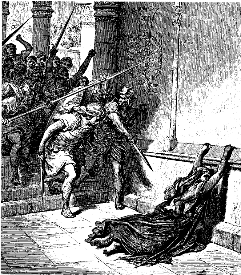
The Death of Athaliah

The Bible is precise in saying it was King Joash who gave the order to repair the temple. This