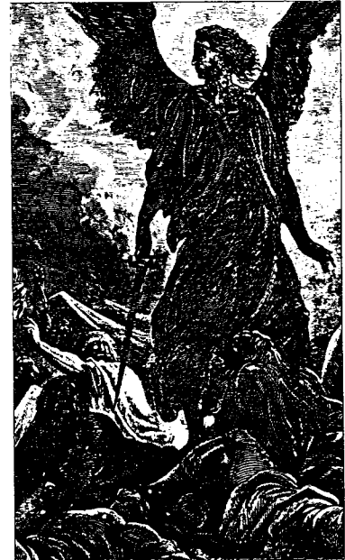
God's Angel Defends Jerusalem

Then the Lord will hear, he will be entreated, he will rescue and deliver his people. “Then will the Lord be jealous for his land, and pity his people ... I will remove far off from you the northern army” (Joel 2:18-20). “It shall come to pass in that day, that I will seek to destroy all the nations that come against Jerusalem” (Zechariah 12:9). “Then shall the Lord go forth, and fight against those nations, as when he fought in the day of battle” (Zechariah 14:3). “And it shall come to pass at the same time when God shall come against the land of Israel, saith the Lord God, that my fury shall come up in my face. For in my jealousy and in the fire of my wrath have I spoken, Surely in that day there shall be a great shaking in the land of Israel” (Ezekiel 38:18, 19).