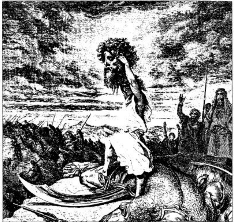
David Victorious Over Goliath

antitypical David, Christ at his second advent. There is also evidence for the stone being a representation of the church empowered with the message of truth. We note that “five” was chosen for the number of the wise virgins. In Daniel 2 there were four parts to Nebuchadnezzar's dream of universal powers. The fifth symbolizes Christ and those saints which are beyond the veil. They are