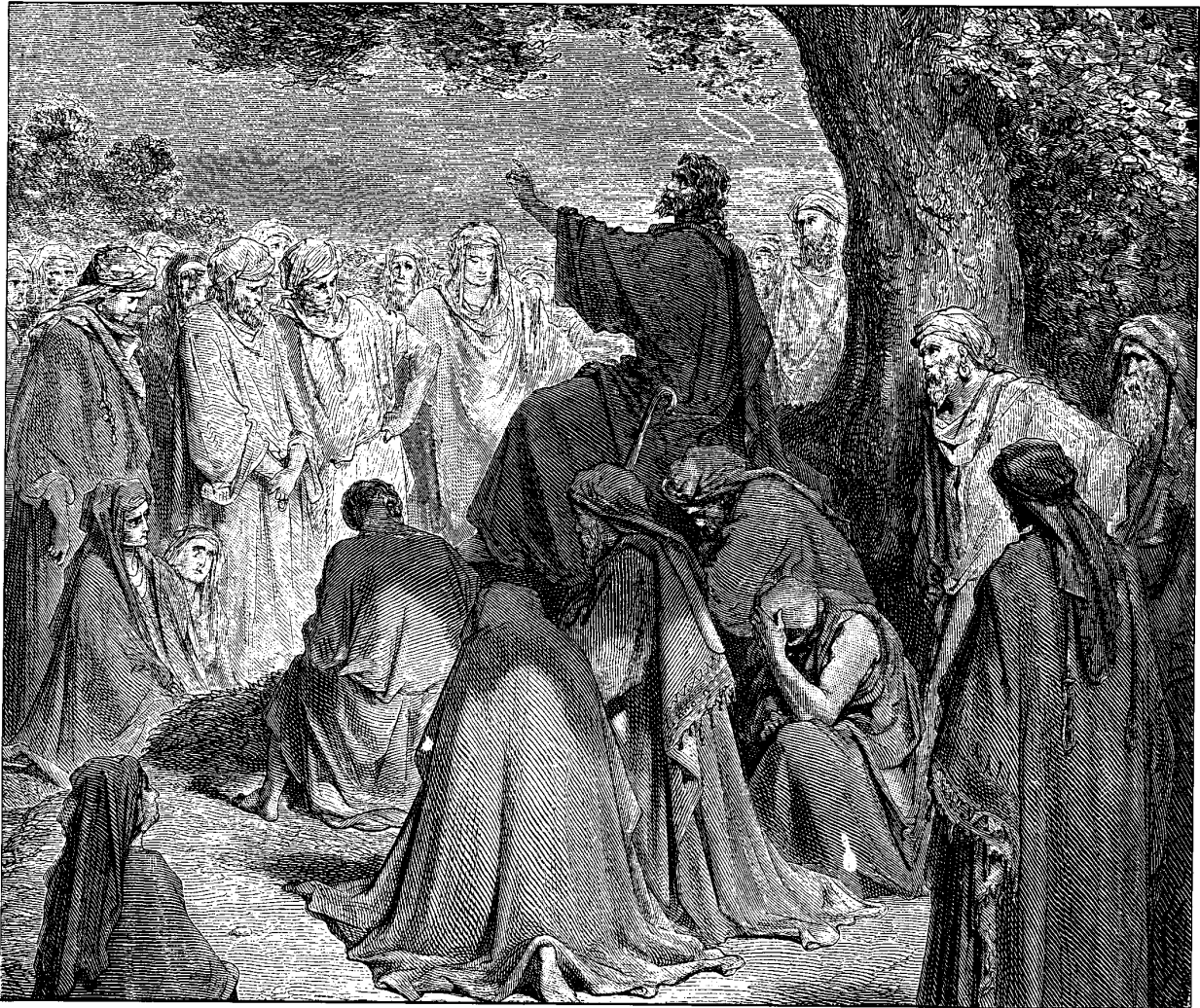
Jesus Preaching to the Multitudes

In the first we understand he represents himself as planning the building of a vast structure - a tower, or stronghold. Elsewhere he has stated his intention - "I will build my church, and the gates of hell shall not prevail against it" (Matthew 16:18). At the time he speaks he is himself engaged in laying the foundation, by the sacrifice of himself as the ransom price. "For other foundation can no man lay than that is laid, which is Jesus Christ" (1 Corinthians 3:11).