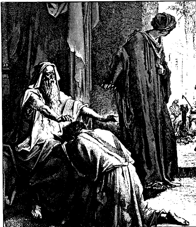
Jacob Receiving the Birthright from Isaac

“Parliament met and, after hearing Disraeli defend his purchase of the Canal as a vital link in the chain of fortresses along the road to India, voted the £4,000,000 without a division. Thereafter the hinterland of the Canal, 'from the Nile to the Euphrates,' was to be an area of acute sensitivity to Britain. To hold the Ottoman gates against any rival intruders was now more than ever essential, unless Britains were prepared to take over the Nile-to-the-Euphrates region herself.