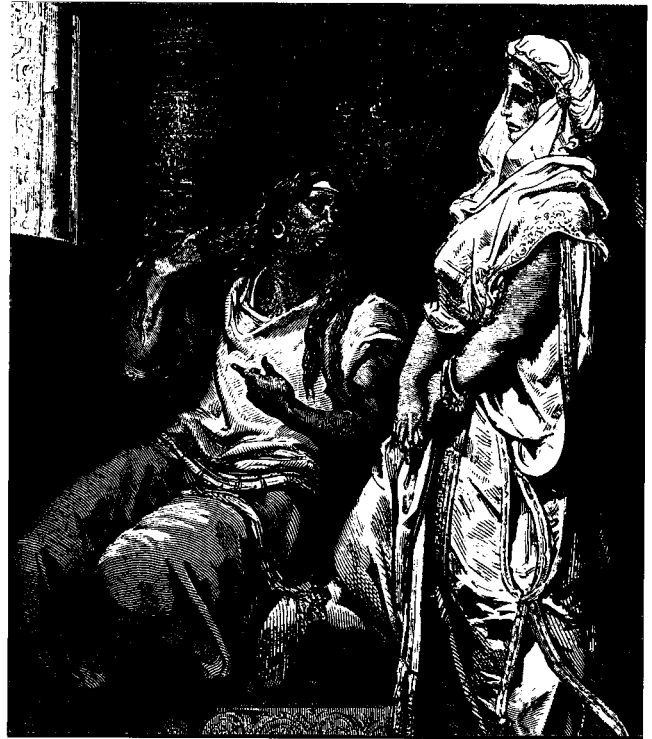
Samson and Delilah

(7) The last phase of the church sees her triumphant again. Samson's hair began to grow, his strength increased, and his last act was to topple the pillars of the Philistine temple and begin a great release from the old oppression, though dying in the process. So the church at the end of the age proclaims the pillars of society will be toppled by the force of the incoming kingdom, and all the world will enjoy the freedom of the next age. The church is taken in the midst of the collapse of this world.