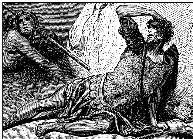
The Conversion of Saul

Respecting the seventh messenger in particular, a hint may be gleaned from the book of Daniel. Chapter 5 records the cryptic handwriting on the wall, "Mene, Mene, Tekel,