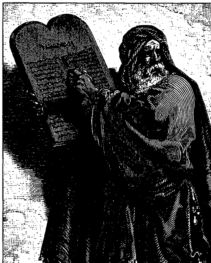
Ezra, who Refurbished the Temple

There is a larger picture as well. The temple represents the Church. "Know ye not that ye are the temple of God, and that the Spirit of God dwelleth in you?" (1 Corinthians 3:16). "Ye also, as lively stones, are built up a spiritual house"