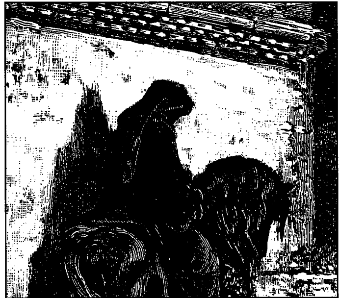
Nehemiah Secretly Assessing the Walls

The narrative of Ezra’s return is found in Ezra chapter seven. By his time the temple had fallen into some disrepair and he accomplished a refurbishing of the temple and reinvigoration of its services and offerings. What might this rep-