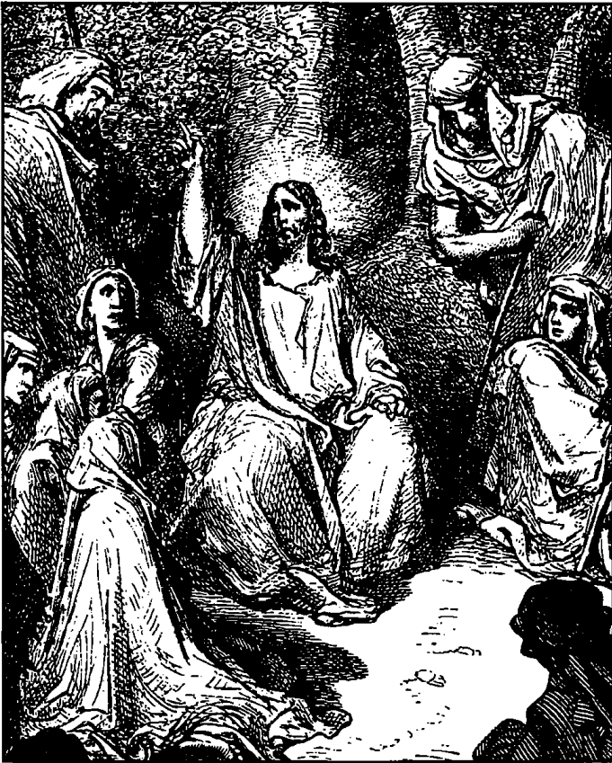
The Sermon on the Mount

By its very nature hate destroys and tears down; by its very nature love creates and builds up. Love transforms with redemptive power.