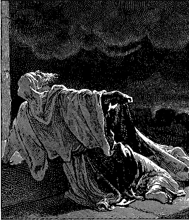
Elisha receiving the mantle of Elijah

described in chapter three, who rouses herself to seek Christ even before he calls, and is richly rewarded in her quest (Song of Solomon 3:1-4).