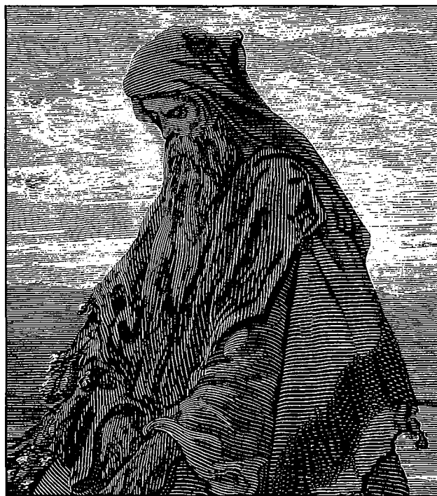
The Prophet Isaiah

back] in the greatness of his strength? I [the risen Lord] that speak in righteousness, mighty to save. Wherefore art thou red in thine apparel, and thy garments like him that treadeth in the winefat [wine vat]? I have trodden the winepress alone; and of the people there was none with me [in the sense of upholding his cause]: for I will tread them in mine anger, and trample them in my fury; and their blood shall be sprinkled [splattered] upon my garments, and I will stain all my raiment. ... And I looked, and there was none to help; and I wondered [was appalled, RSV] that there was none to uphold: therefore mine own arm brought salvation [victory, RSV] unto me; and my fury [righteous indignation], it upheld me. And I will tread down the people in mine anger, and make them drunk in my fury [similar to when Moses forced the Israelites to drink the golden calf, which he had powdered and mixed with water, Exodus 32:19, 20], and I will bring down their strength to the earth.