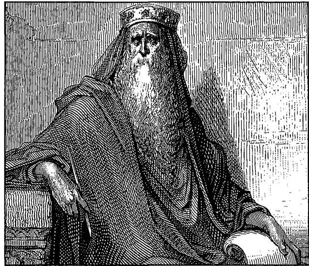
Solomon, author of Song of Solomon

One more scripture relevant to the vintage harvest being taken before wintertime, is Revelation 14:14-16. This is the