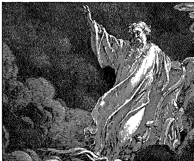
The taking of Elijah

Elijah's being taken up into the sky 1 at the close of his life is usually agreed to represent the taking of the saints at the end of the Harvest. The four locations he visited during his last experiences — Gilgal, Bethel, Jericho, Jordan — may represent four conditions of the Church during the harvest. They begin in Gilgal (Christendom), move to Bethel (the Truth Movement during the days of Bro. Russell), thereafter to Jericho (the subsequent divided condition of the brethren), and at last come to the Jordan (a later stage of the harvest, perhaps now beginning).