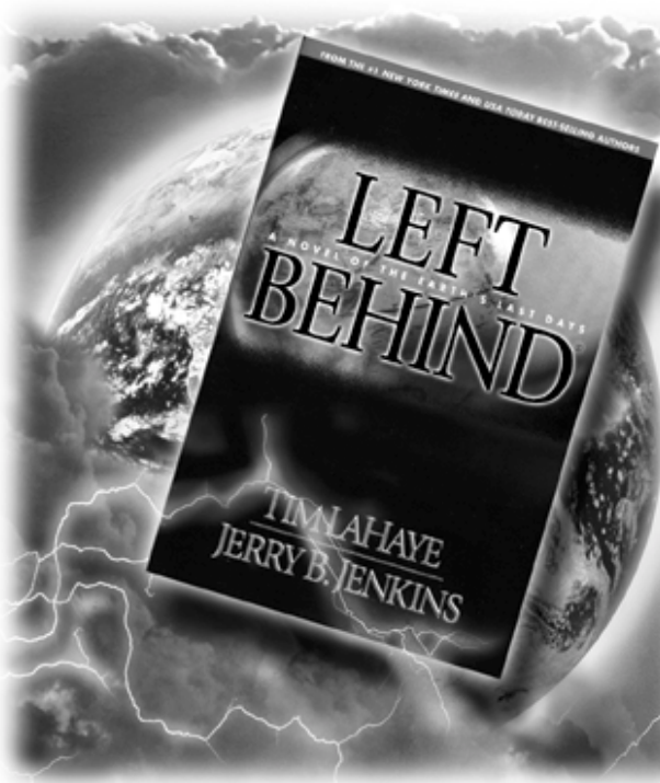
LaHaye/Jenkins' novel LEFT BEHIND does not support the views presented herein

In their dramatic depictions of God's anger, there is one issue of mercy which LaHaye and Jenkins merit to God's character. Their scenario is that children under an undefined age of accountability are spared because of ignorance. Man's own compassion can not abide the thought that innocent children will be sentenced to an eternity of torture for having not had the chance to knowledgeably accept Christ. But we point out that there