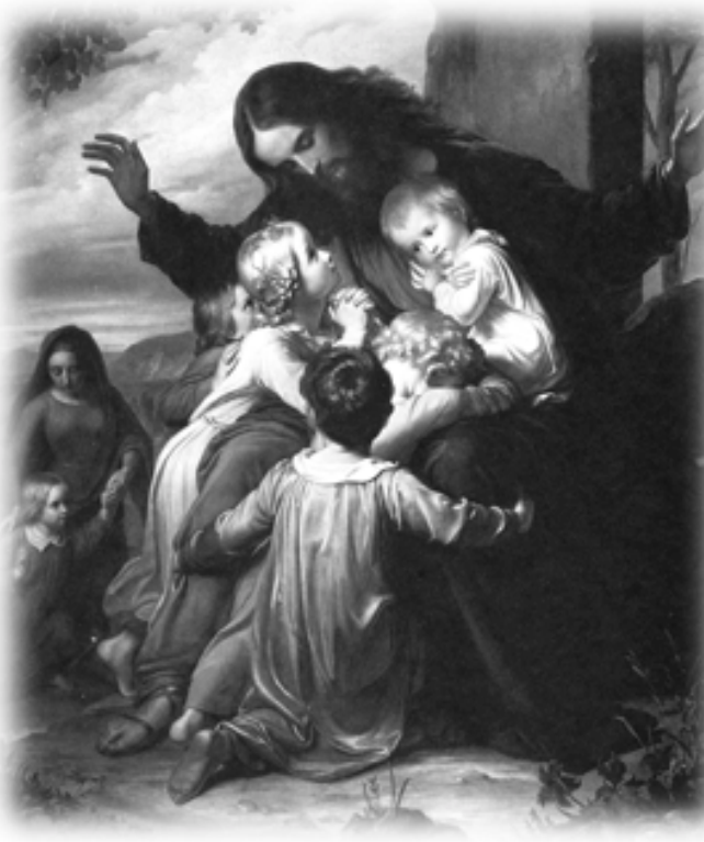
Jesus Christ "...by the grace of God should taste death for every man..." woman and child. Heb. 2:9

The popular doctrine of the secret rapture is that Christ will return to earth, unknown to the world, and will take those who have accepted salvation through