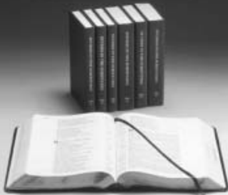
Six Individual Volumes of Topical Bible Study