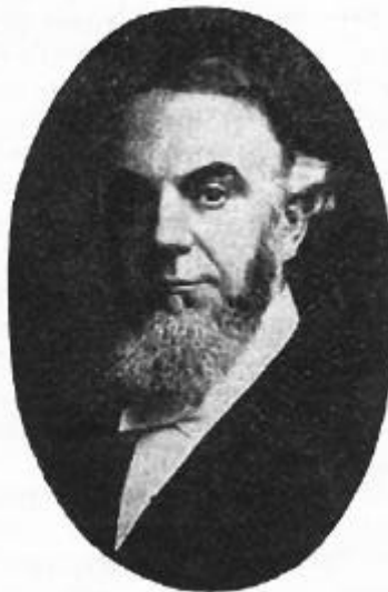
Brother C. T. Russell.

The world considers this work book selling. No other book has been excluded from the bookstores, public press, etc. as much as the Dawn, yet no other book has had such a sale. It is the Lord's doings and marvelous in our eyes. This work is preaching, making known the glad tidings in the most effective manner.